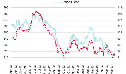
Siam Cement (SCC TB)